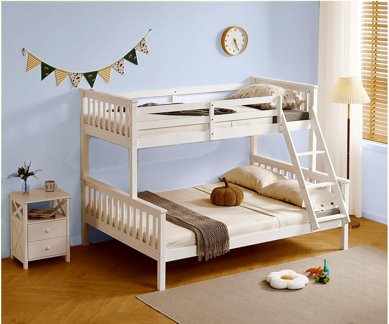
HANNAH TWIN SLEEPER BUNK